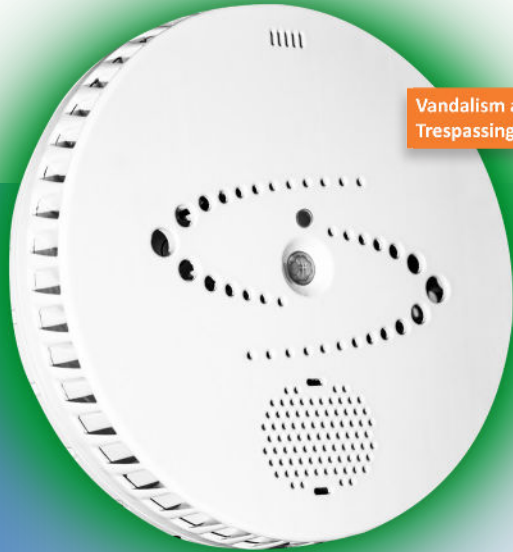
HALO Smart Sensor is Multi-Patented and Design is Trademarked