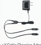
1 x Y Cable Charging Adaptor with Dual Micro-USB Connectors