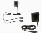
1 x Y Cable and 1 x Single Cable Adaptor