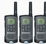
3 x T200 Radios